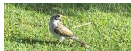
・Rainbow Lorikeet (ゴシキセイガイインコ) ・Noisy Miner (クロガオミツスイ)