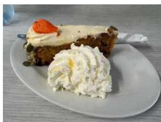
👉 carrot cake

I ate lamb, homemade pizza and hamburgers. I had a barbecue at home. It is common in Australia. About sweets, I ate a carrot cake, a slice of banana bread, lamingtons, jelly with custard cream, and a meringue cake with passion fruit. These sweets were so sweet, but I want you to try a carrot cake and lamingtons if you go to Australia.